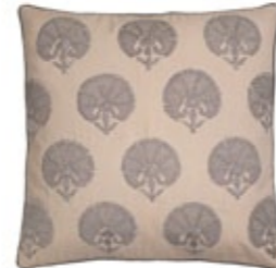
DAY GRANDI FLORA