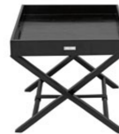
DAY CONVENIENT Low foldable table in black sheesham wood