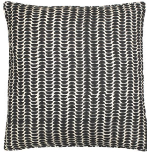
DAY HALF MOON