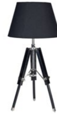
DAY ARTISTIC LIGHT Lamp incl shade, available in black and white