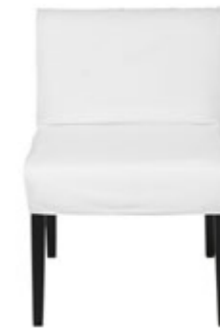
DAY GUEST Chair with loose cover, available in different fabrics and colors