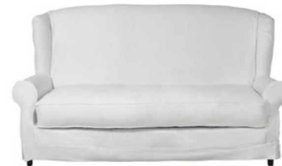
DAY COTTAGE SOFA Sofa with loose covers, available in different fabrics and colors