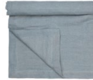
DAY LINEN VINTAGE WASH