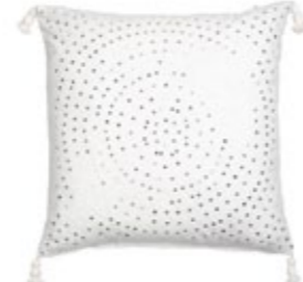
DAY CIRCLE DROPS