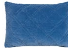
DAY VINTAGE VELVET