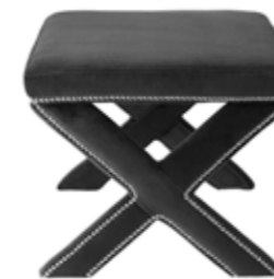
DAY STOOL H45xW50xD50CM