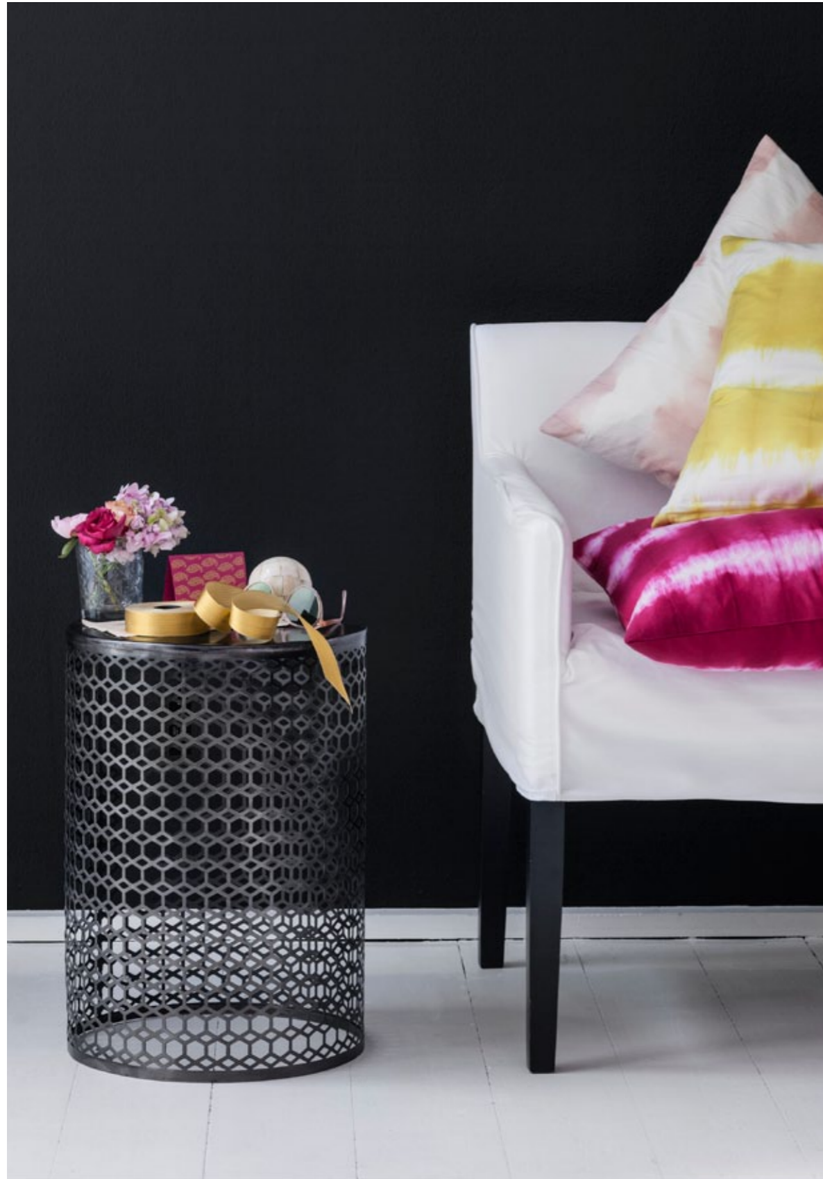
1: Day Vintage Velvet, cushion cover in cotton velvet, 60x60cm, 2: Day Ceiling, cushion cover in silk, 3: Day Astro, cushion cover in silk, 50x50cm, 4: Day Clime, cushion cover in cotton, 40x60, 5: Day Coach, cushion cover in cotton, 6: Day Frangipani, cushion cover in silk, 40x40cm, 7: Day Vintage Velvet, cushion cover in cotton velvet, 40x60cm, 8: Day Coach, plaid in cotton, 9: Day Silkyway, cushion cover in silk, 50x50cm, 10: Day Charlot, cushion cover in cotton, 50x50cm, 11: Day True Hippie, cushion w. filling, 12: Day Pulse, cushion cover in cotton, 50x50cm, 13: Day Vintage Velvet, cushion cover in cotton velvet, 40x60cm, 14: Day Como, bolsters w. filling