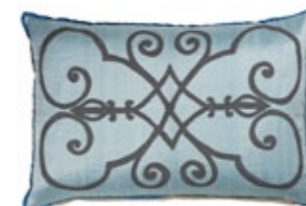
DAY PARK FENCE