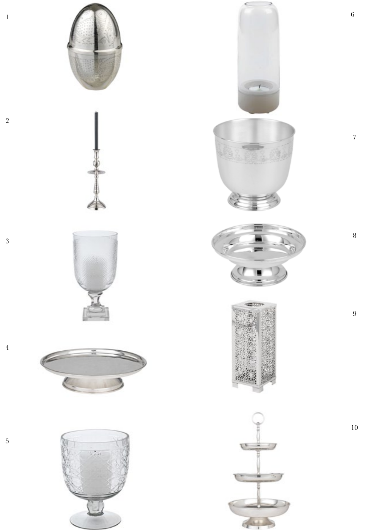
1: Day Goose, container in silver; 2: Day Antique Silver, candlestick in silver; 3: Day Glass Collection, vase in glass; 4: Day Platter in silver; 5: Day Glass Collection, vase in glass; 6: Day Lanterna, lantern white; 7: Day Holy Flower, silver pot holder; 8: Day Holy Plate, candleholder in silver; 9: Day Escalator, silver lantern; 10: Day Etagier in silver