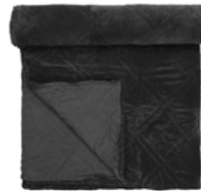
DAY VINTAGE VELVET