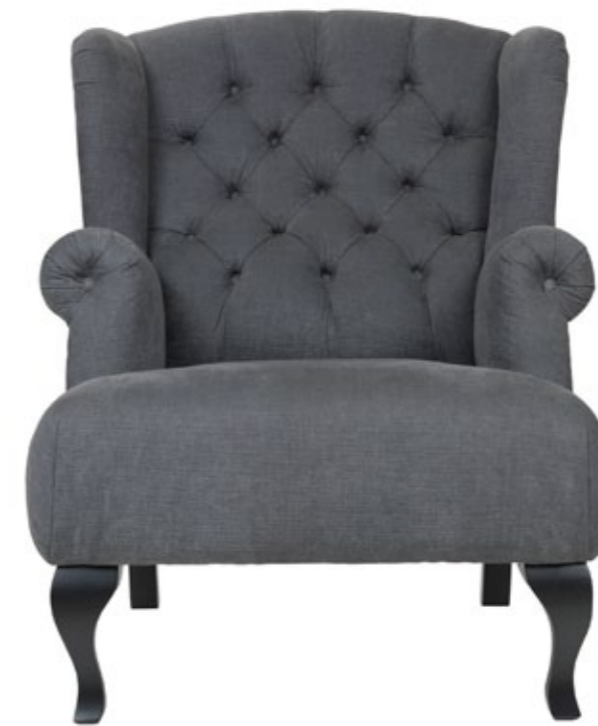
DAY NAP Armchair, available in different fabrics and colors