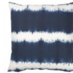
DAY WAVES TIE & DYE