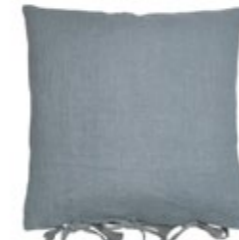
DAY LINEN VINTAGE WASH