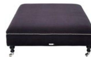
DAY CONVENIENT BENCH H98xW100xD100cm