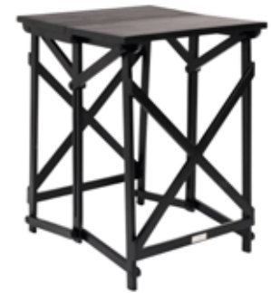
DAY CAMP TABLE Foldable table in black sheesham wood