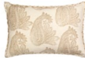
DAY GLAM PALACE