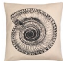
DAY THE SEA