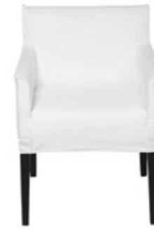
DAY SPECIAL GUEST Chair with loose cover, available in different fabrics and colors