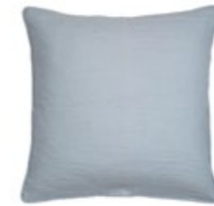
DAY LINEN VINTAGE WASH